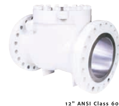
12" ANSI Class 600